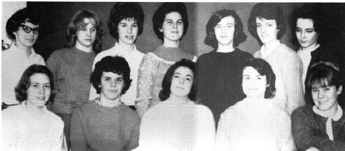
TWELVE MEMBERS of the executive and editorial staffs of the '63 Driftwood assemblé.